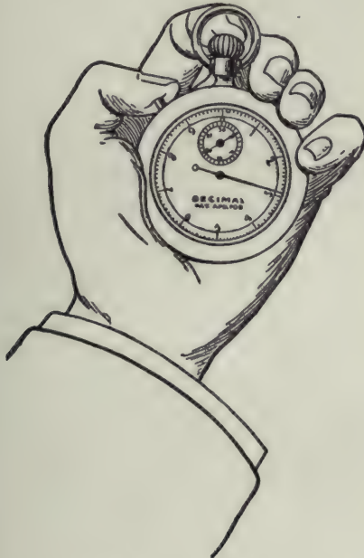
FIGURE 4.—STOP WATCH WITH DECIMAL FACE

We are now ready for the stop watch, which, to save clerical work, should be provided with a decimal dial similar to that shown in Fig. 4. The